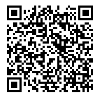
QR Code to CalFresh Screener

*CA Senate Bill 708 (Mendoza, 2015) requires LEAs who have their school meal application available online to include CalFresh application link on their website.